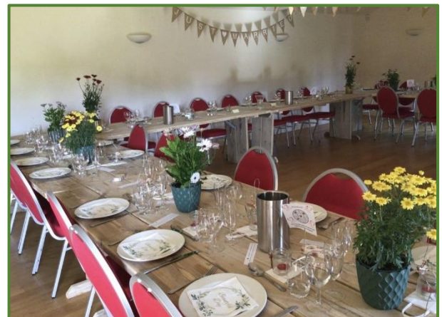
The Hall looking resplendent for a recent wedding reception