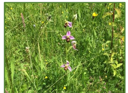
A stunning Bee Orchid in our garden!